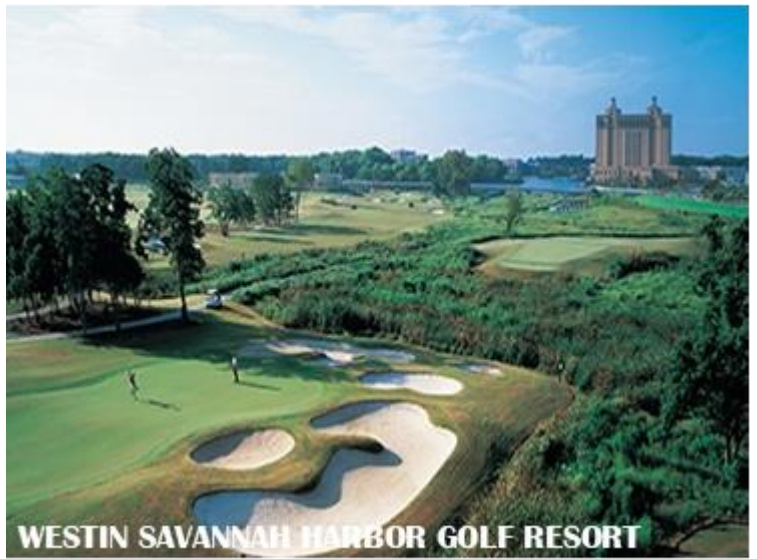
WESTIN SAVANNAH HARBOR GOLF RESORT

The GBI Medical Examiner's Office is accredited by the National Association of Medical Examiners. To learn more about the GBI Medical Examiner's Office, visit http://gbi.georgia.gov/medical-examiners-office .