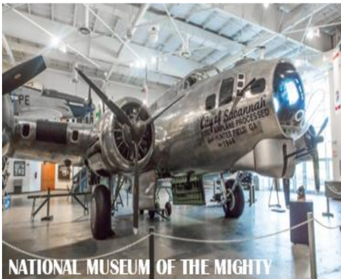
NATIONAL MUSEUM OF THE MIGHTY