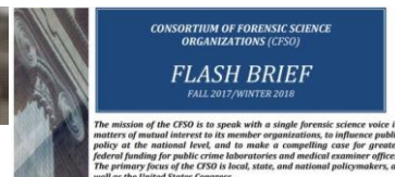
CFSO Flash Brief