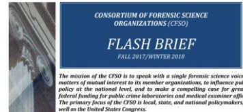
CFSO Flash Brief