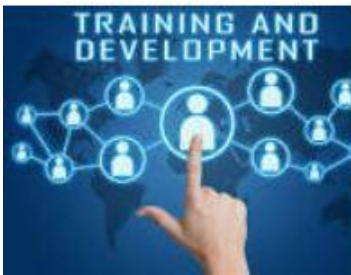
Webinars and Classroom