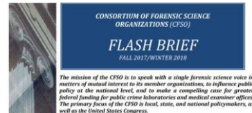
CFSO Flash Brief